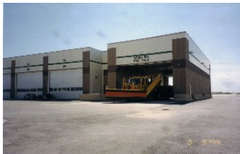
KCI Fueling & Maintenance Bldg